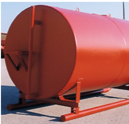
Pump Platform shown on large skid tank.

The total square surface area touching the ground is roughly equivalent to that of our skids, which helps minimize the risk of the tank sinking into soft foundations.